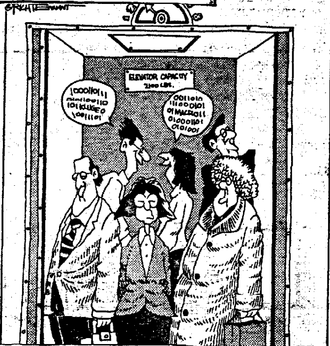
Real Programmers love to talk computerese while ordinary citizens are listening.