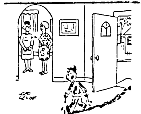
"We can't spank him. He's the only one in our family who knows how to use our home computer."

These folks are almost in our own backyard! Just up north a bit. Want to really upgrade? How about a hard disk? An expansion system WITH a disk drive? You can even go to a double sided drive option if you like. The system is called the MPES/50 Mini Peripheral Expansion System. It contains 32k RAM, 1 RS232 Serial Port, 1 Parallel Port, 1 Double-Density Floppy Disk Controller and 1 SSDD Floppy disk drive. You may set this system into Warp Drive by adding a hard disk available in 5-, 10-, and 15-Megabyte models. For more information write to MYARC, INC., P.O. Box 140 Basking Ridge, NJ 07920 or call 201-766-1700.