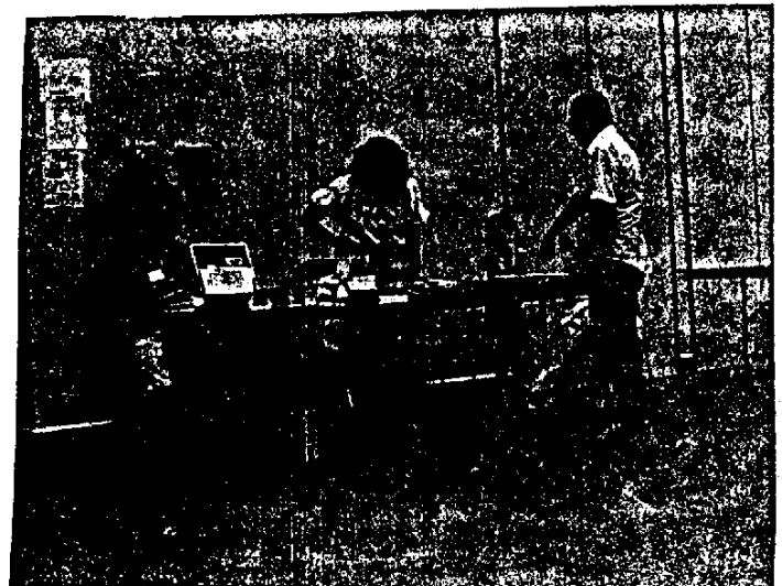
SWAP-N-SHOPPERS DOING THEIR → BEST AT NOTHING

ALL PHOTOS SHOT BY STEVEN DEGEARE (C) APRIL 1999 -- PERMISSION IS GIVEN TO BE DUPLICATED