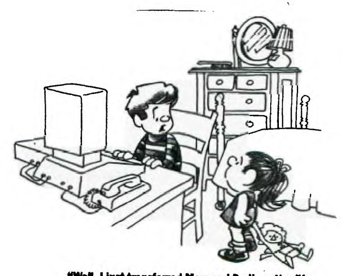
"Well, I just transferred Mom and Dad's entire life savings to our secret bank account in Switzerland. Now, how do we get there?"