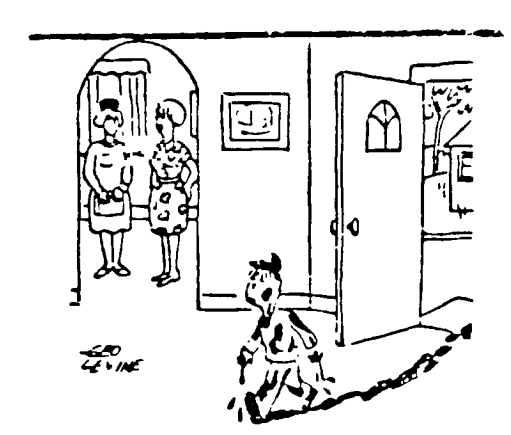
"We can't spank him. He's the only one in our family wife. knows how to use our home computer?"

These folks are almost in our own backyard! Just up north a bit. Want to really upgrade? How about a hard disk? An expansion system WITH a disk drive? You can even go to a double sided drive option if you like. The system is called the MPES/50 Mini Peripheral Expansion System. It contains 32k RAM, 1 RS232 Serial Port, 1 Parallel Port, 1 Double-Density Floppy Disk Controller and 1 SSDD Floppy disk drive. You may set this system into Warp Drive by adding a hard disk available in 5-, 10-, and 15-Megabyte models. For more information write to MYARC, INC., P.O. Box 140 Basking Ridge, NJ 07920 or call 201-766-1700.